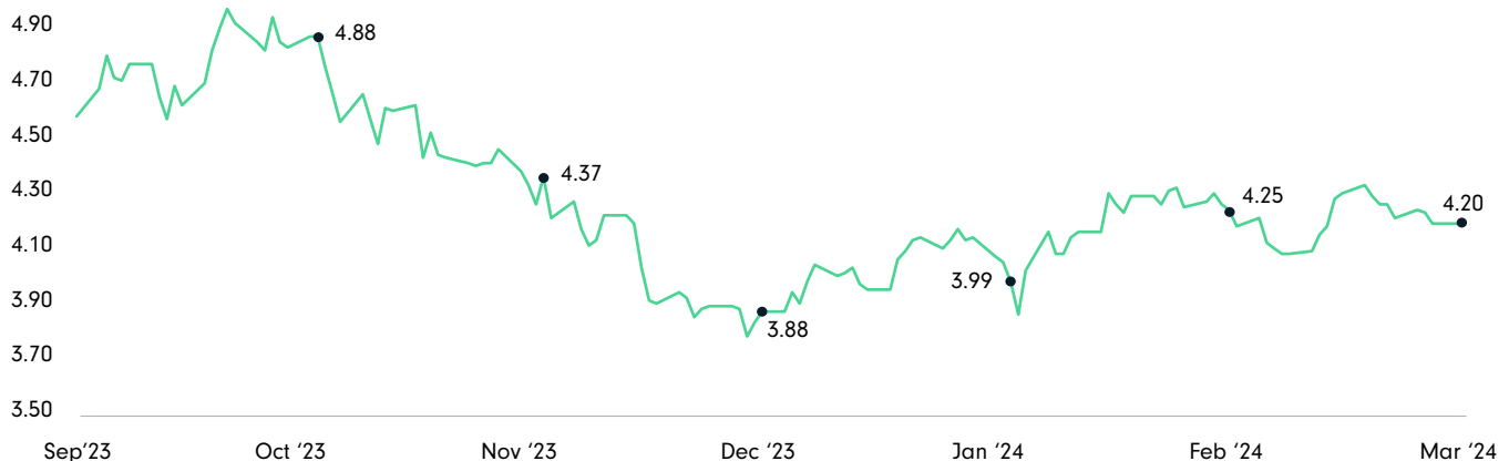
Exhibit 1 – 10-Year Treasury Yield (%)