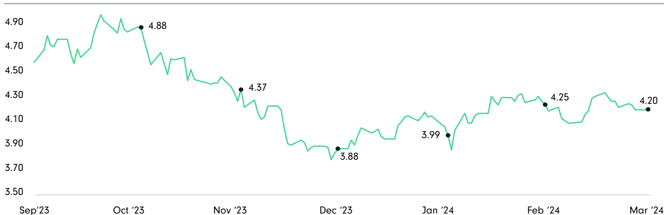
Exhibit 1 – 10-Year Treasury Yield (%)